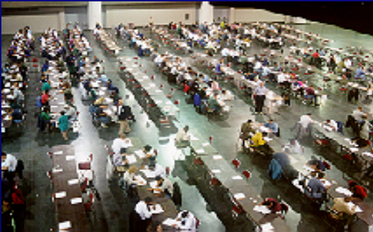
Typical Police Officer written examination.

When systems are established and stabilized, processing time can be dramatically reduced.